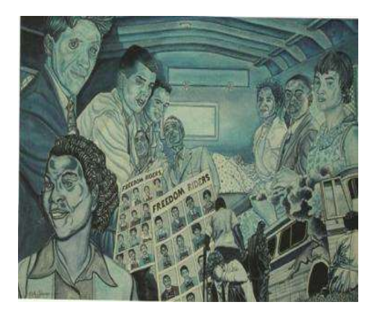
"Travelers for Freedom (Study)" Pen and Ink and Water Color 16" x 24"

Over the years, my style has transformed from a purely naturalistic style to a more abstract realistic style. The majority of my works of art are relative to the African American experience. Even though I received my highest degree in drawing and painting, I enjoy working in other media as well. The emotional impact of the subject matter I choose to create is what influences me to work in a particular creative art method, medium, or mixed media.