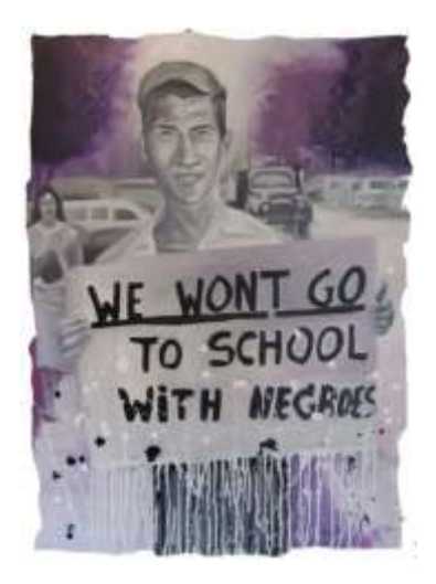
We Won't Go 30"x22"

on. Ansel offers an eclectic collection of original paintings, minimally numbered, and signed gicleé reproductions for the contemporary art lover which include certificates of authenticity.