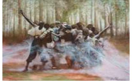
"United We Stand" Oil on Canvas "30 x 40"