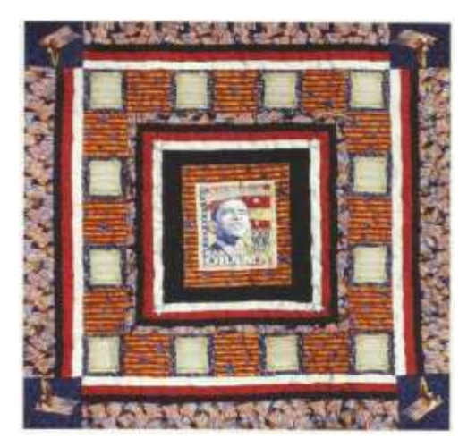
"The Promise" Textiles 69" x 74"

Creating beautiful artwork using stitches and strokes has become a new journey for me. While I may start with an idea, I enjoy the creative flow and the feeling of being lost in the transition of painting a picture on canvas, or sewing to make fiber art. It's like being in a trance and when I awaken, I have created an extraordinary work of art just in that magical moment. The completed work is always more than I originally envisioned. My Reflections collection of three oil paintings combines images of yesterday with modern abstract art of today. With the use of oil paint and resin on torn canvas, I have portrayed a point in history when water was used to torture the spirit of a people striving to do better. Other collections include 5 Obama quilts, a tribute to our first African-American President. The quilts depict historical events that occurred during President Obama's first term in office. I quilt personal images using painting techniques with thread and acrylic paint to make the photo appear three dimensional. My work is my mission and you are invited to join me on my journey.