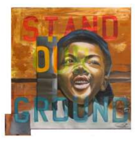
Stand Our Ground 24"x24"