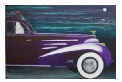
"They Drive Packards Too" Acrylic "14 x 17"