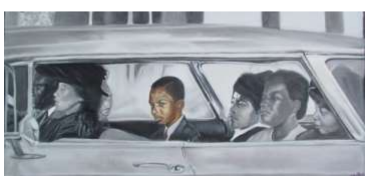
Prelude to a (Civil Rights Leader's) Funeral 36"x18"