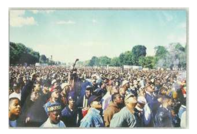
"Million Man March" Photograph 20" x 30"

Art is the sum of life and life is the direct result of divine artistry.