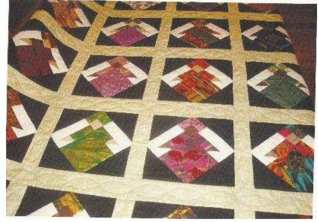
African Princess Textiles

My earliest artistic inspirations came from my grandmother, who taught me how to sew and quilt. My craft quickly became an integral part of the (United Community) Center's after-school programs, senior citizen programs, and the adult quilting classes that I taught. Over the years, my main focus has been to keep the art of quilting alive. Furthermore, my work with the Center's outreach programs has supported my ongoing advocacy for justice, particularly for the elderly and the youth of my community.