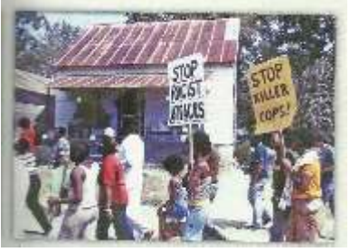
"Wrightsville March #2" Photograph 18" x 23"