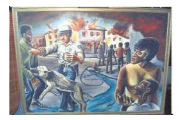
"Riot U.S. A. 1969" 50" x 38"

It is my hope that my work will become a part of exhibitions that travel across the United States for many years to come. I will have accomplished my goal as an artist when my various Series circulate and become known in numerous cities.