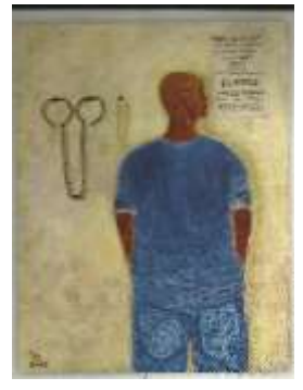
"Chains" Acrylic on Linen 11" x 14"

"United We Stand for the Struggle" B&W Panatomic "16 x 20"