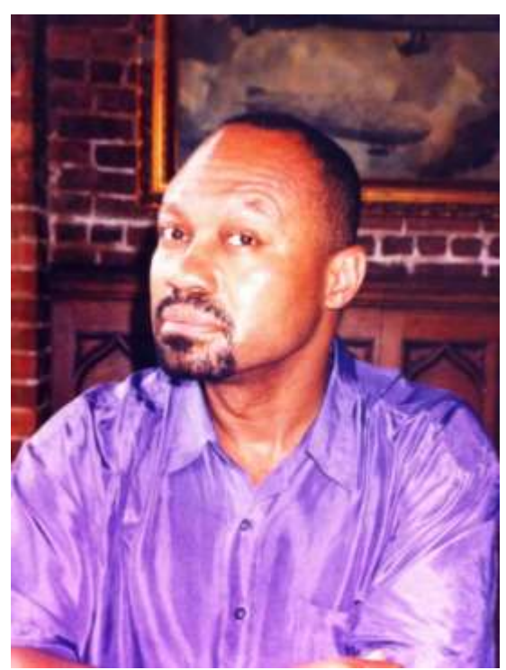
in a file marked "Kooks and Nuts."

Carl Christian explores and experiments with combinations of tactile and implied textures of largely-unnoticed everyday objects. These materials invoke nature's own infinite delight of total abstraction.