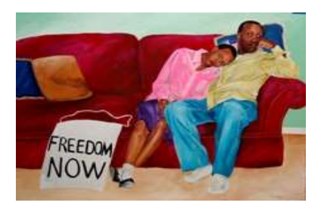
"Maybe My Last March" Gouache on Paper "29 x 41"

a B.S.E.E. (Electrical Engineering) degree from Tuskegee University in 1971.