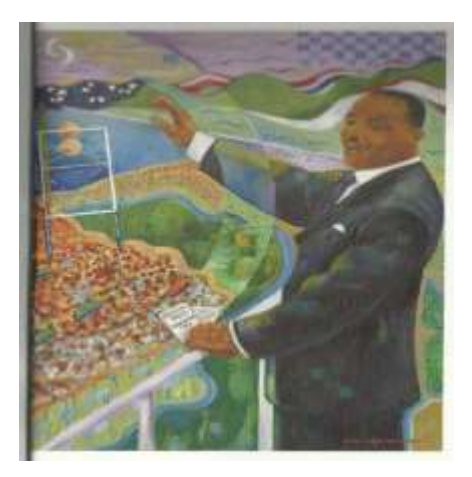
"I've Been to the Mountaintop" Oil on Canvas 36" x 48"

My works on canvas are occasionally abstract, but generally figurative images, with mixed media and acrylics being the preferred media. I like the richness and luminous effect that one gets by expanding the human figure with layers of materials as well as the quick way I can work on a series of ideas on one or more canvases at the same time. Most of my ideas for subject matter for my larger works have come from study of abstract expressionism in art history and my ties to a "Southern Heritage." Since I have worked in the South for the past thirty years, I have developed a deeper understanding of the struggle for civil rights, and many of my thematic paintings have been directed to that subject matter. In fact, these have become my most expressive and thought provoking works.