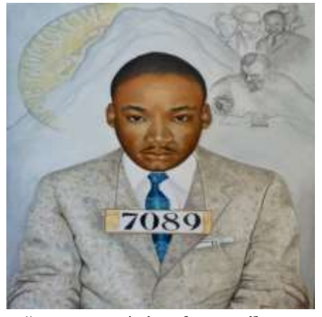
"MLK, Jr./Live from B'ham Oil on Canvas 30" x 40"

"16<sup>th</sup> Street Ambiguity" Mixed Media "30 x 40"