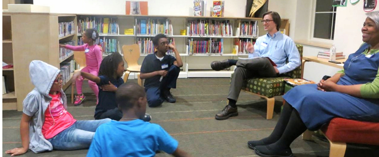
Prime Time Family Reading Time leaders at the Inglewood Branch Library discuss the importance of reading