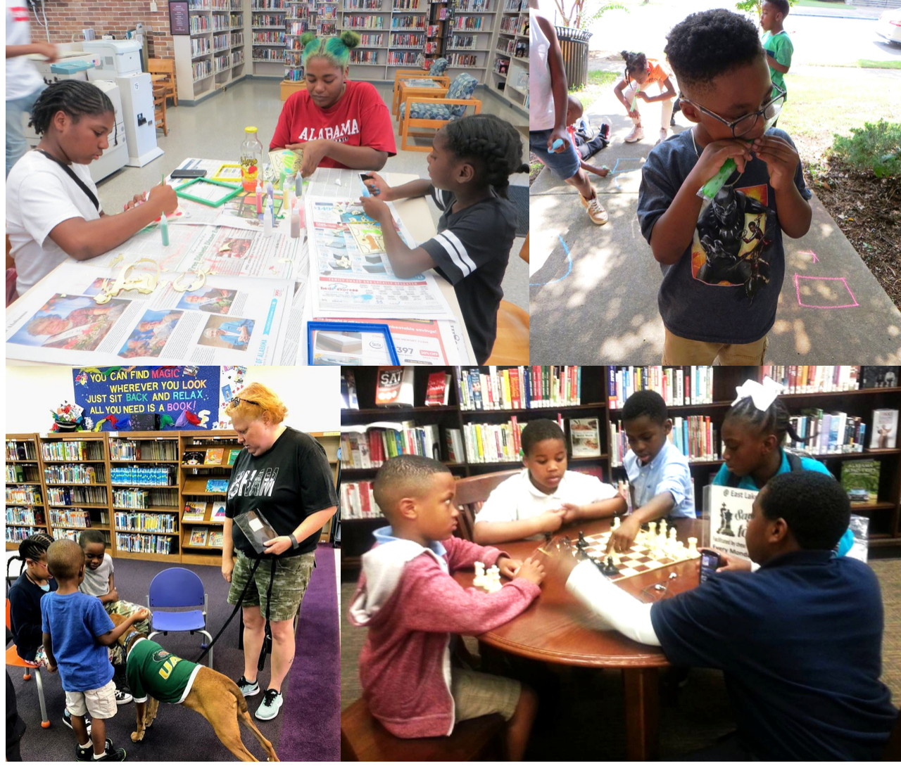
L-R: Creating a make-and-take art project on Craft Day at the Wylam Branch Library; drawing sidewalk art while cooling down with ice pops at the Avondale Regional Branch Library; learning about animals at Grubdown at the Springville Road Regional Branch Library; strategizing at Chess Club at the East Lake Branch Library

Birmingham Public Library's 19 locations have plenty of free after-school activities and resources to help Birmingham school children gain knowledge and have fun. Our libraries across the city offer a safe and friendly learning environment where kids can study and do homework, read books, play games, make crafts, and more.