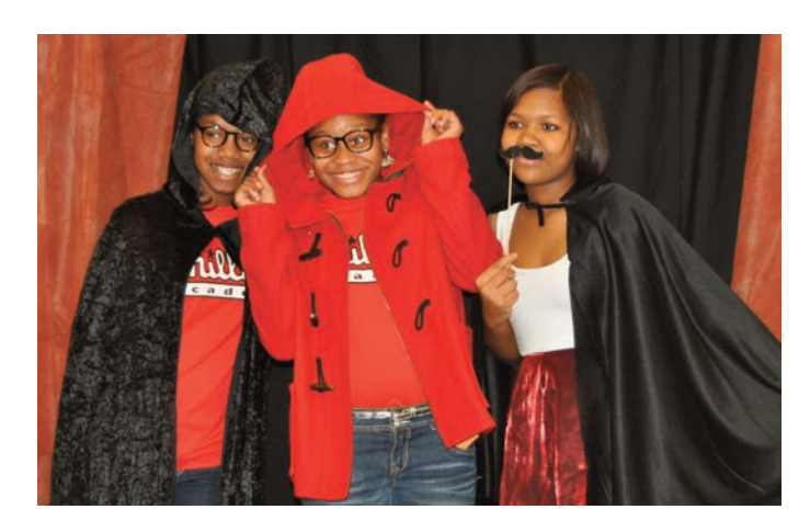
Hallo-Read Family Fun Celebration The fourth annual event was held at the North Avondale Branch.

Ghouls' Ball The fifth annual Halloween party was held by the BPL Youth Services group at the Central Library.,