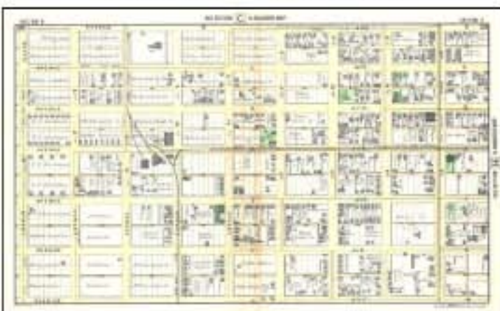
Atlas of the City of Birmingham and Suburbs - Plate G Beers, Ellis and Co. Date Original: 1887 From the Rucker Agee Map Collection